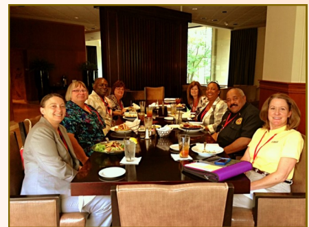
Participants enjoying lunch at the Sheraton