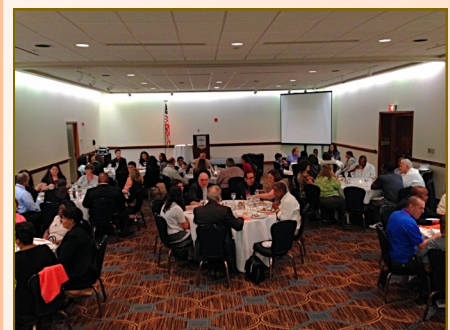
The closing banquet