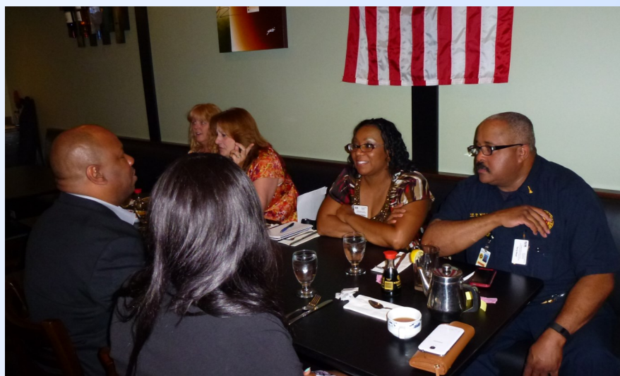
Members enjoyed networking at the June event